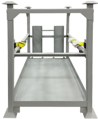
Transport Cage for Model 2755