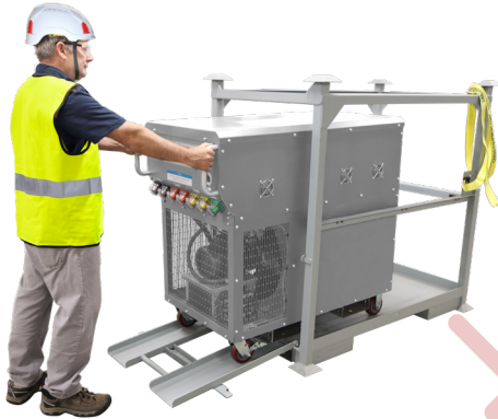
Model 2775 loading into Transport Cage