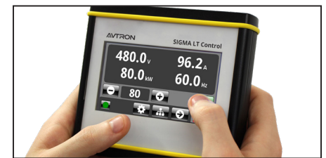
Optional SIGMA LT Hand-Held Controller.

SIGMA software can be updated free of charge through the Avtron website at the following link .