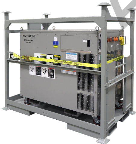
Model 2805 secured in Transport Cage