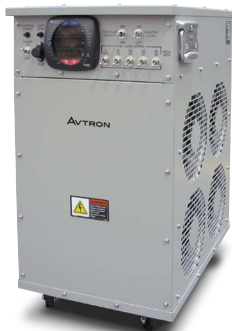
LPH100 100 KW Compact, Portable Avtron Load Bank.